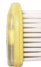
G99T (hard cleaning) G77T (gentle cleaning) G55R N55R (soft cleaning)

All parts are patented and available for sale.